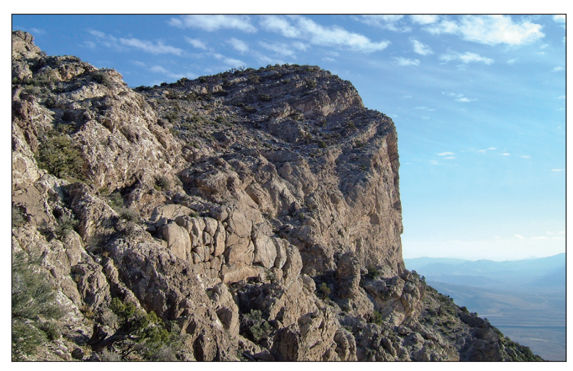
Figure 1 — View of the Turtlehead Peak summit from west ridge.

The frustration and difficulties in getting out (I could hear everyone, just not talk to them) led me to the idea of carrying a Tokyo HyPower 45 W amplifier for the 817ND. The puzzle was how to power it. I am not an electronic whiz so, because I had to fly, my plan was to power it with 10 D-cells. My radio budget reached its limit with the