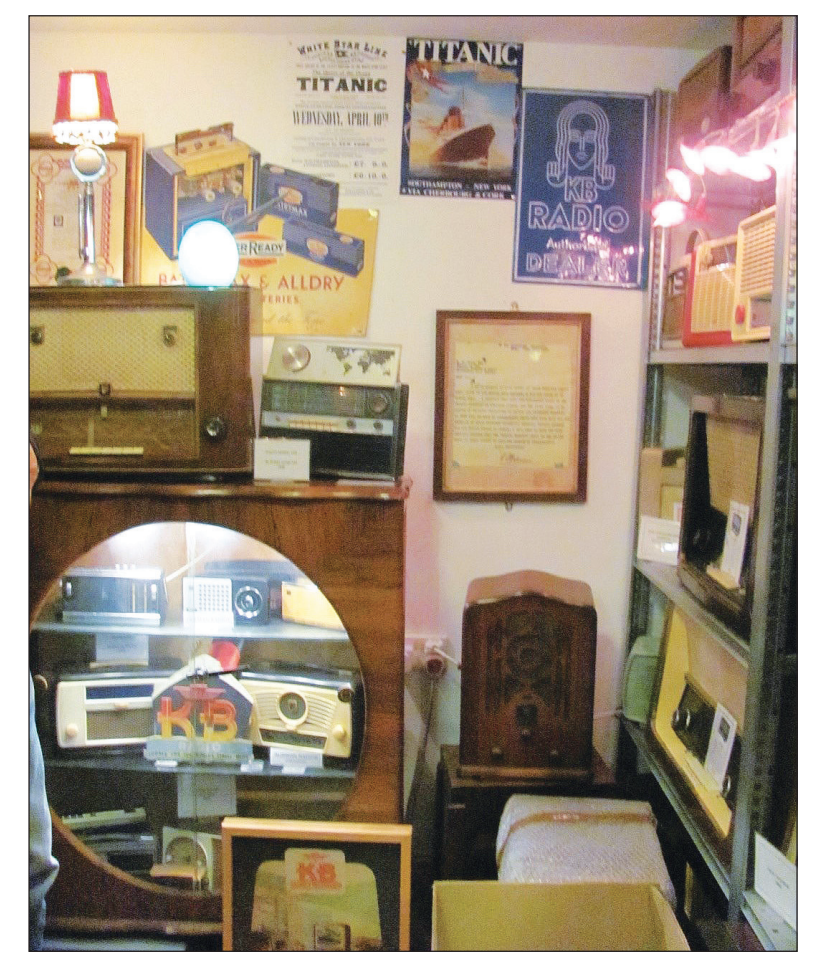
Figure 3 — Some of the radios in the museum, including a D-104 microphone (top left) that has been made into a lamp.