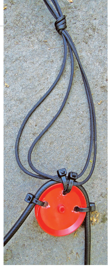
Coax cable strain relief plastic pulley assembly.