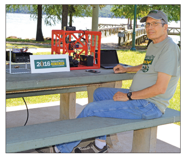
The author at the portable EME operating position.