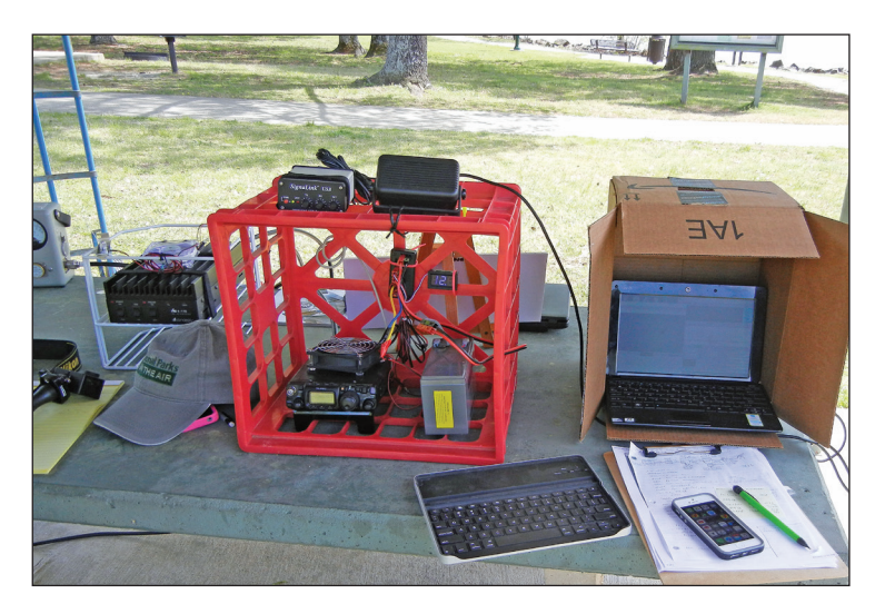
The EME station on a picnic table.