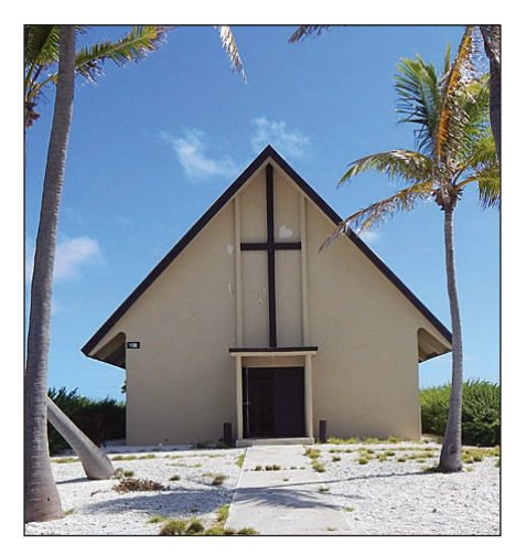
Figure 4 — This abandoned chapel near the ocean became the location for the two CW stations

After checking in, we headed back to the airfield to gather our equipment pallets, which had been previously shipped to Wake by Kimo, KH7U. Everything had arrived safely and after loading the truck, we were on our way to set up the stations. The USAF offered us two locations: an abandoned chapel near the airfield that