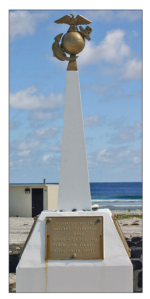
Figure 3 — The Marine Memorial erected in 1966 in honor of those lost in the Battle of Wake Island.

Pentagon, including General Hawk Carlisle (Commander, Pacific Air Forces).