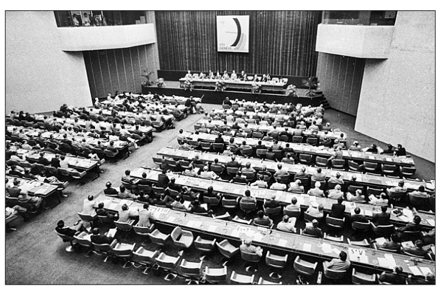
The 1979 World Administrative Radio Conference in Geneva, Switzerland.