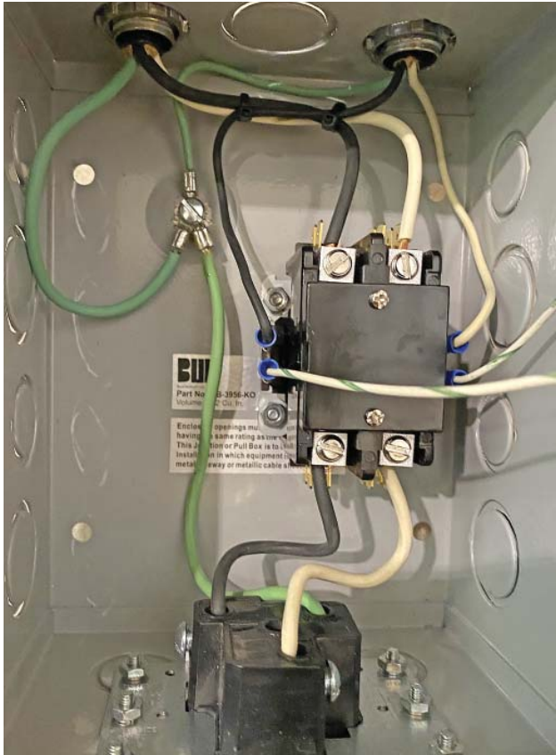
If you don't want to constantly run your equipment at your base station, try creating a relay box. When operating remotely, I use a 110 V smart switch to trigger the relay and the circuit on the 220 V line.