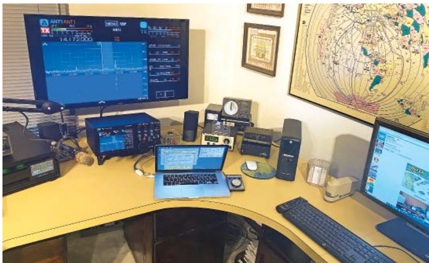
My base station is set up at my home in Connecticut.

closes the circuit on the 220 V line. The ability to switch equipment on and off will help protect it against power surges. Also, cycling it on and off periodically (such as with your modems and routers) can be beneficial.