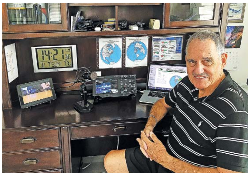
My remote station is in southern Florida, where I operate using a FlexRadio Maestro or a computer.

No matter what the distance is from your base station, remote operation is vulnerable to bad weather, particularly lightning. I'm not aware of a product that can protect your equipment as well as disconnect power. However, one approach is installing PolyPhasers on the coaxial lines to prevent RF surges. This can be done outside by adding a ground for each PolyPhaser, or inside if there's a suitable