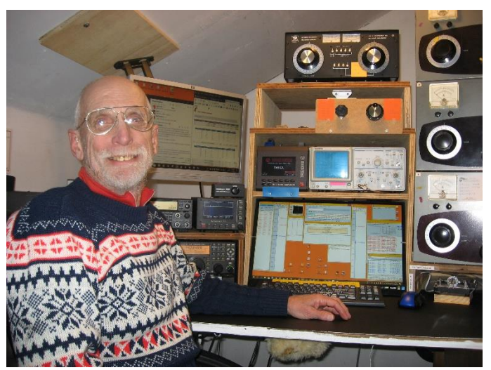
W6SX made 1140 QSOs using a wire antenna 46 feet high and a festive sweater!