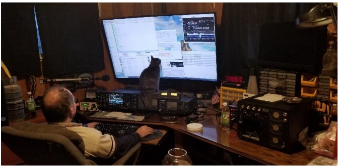
It looks like the CAT interface at NR2C was operating purr-fectly!

NR2C placed 5<sup>th</sup> in the region SOUHP, but questioned his eligibility: "The 8 yr old granddaughter watched for a while but the biggest 'helper' was the kitten we adopted a couple of months ago. My question is: Does a feline observer disqualify me from SOHP Unlimited class?" In SOULP, W3FIZ made it into 5<sup>th</sup> overall, whilst K3ZU held on for 10<sup>th</sup>.