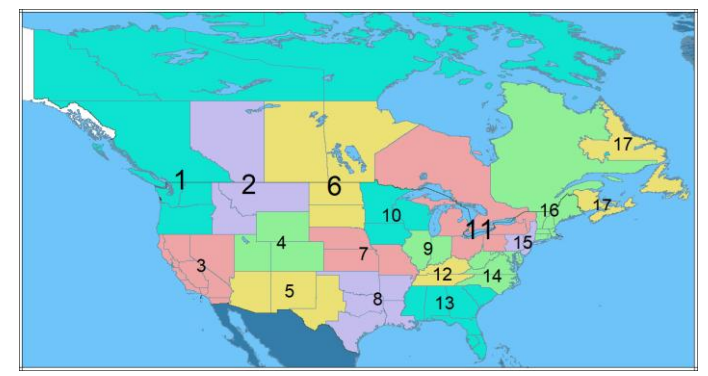
The 222 MHz and Up Contest is organized into 18 Regions, recognizing the geographic disparities of a continent-wide VHF+ contest. Each Region has its own leader tables and is covered separately in the writeup. (Map by K9JK, based on EI8IC's <u>mapability.com</u> North American Overlay Map)

paired up to be the top RF reachers on 2.3 and 3.4 GHz, traversing 519 km between their stations. With the 10x point multiplier for 3.4 GHz, that QSO was also the highest point earner at 5190 points. W5LUA pointed his 10 GHz antenna down toward W3XO/5 to accomplish the top DX for the band at 406 km. For 5.7 GHz, K1GX and N3RG were parties to that band's longest QSO at 360 km. W5LUA was also part of the team that completed the longest reported QSO on 24 GHz, at 19 km with AA5C but K3TUF and W3SZ were close behind, completing a QSO over an 18-km path.