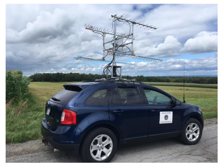
The KF2MR/R rovermobile.

Jarred, KF2MR/R visited FN02, FN12, and FN13 with 8 bands to complete 94 QSOs and claim the Rover top score of 62,560 for the region. EN92vw was the region's place to be for Single-operator with Steve, VE3ZV completing 68 QSOs across 6 bands for a score of 46,217.