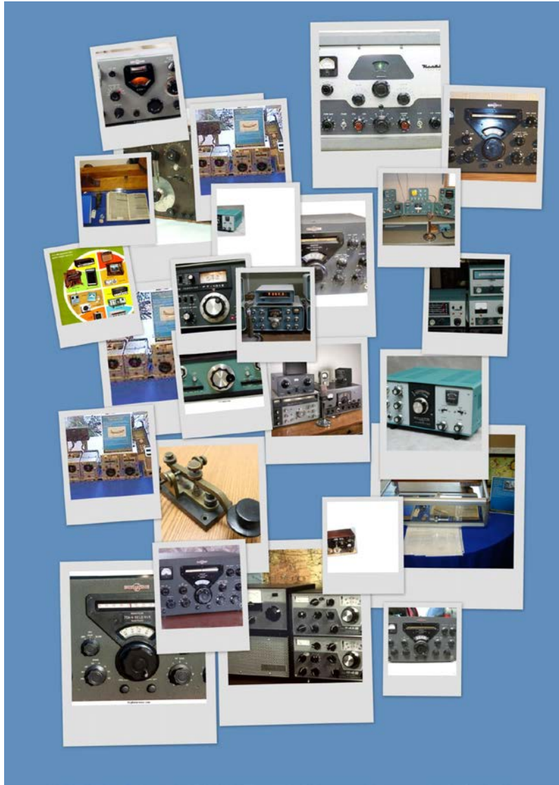
Recent Exhibits ARRL HQ Lobby

Historical Group activities at HQ continued uninterrupted. Specifically, the group conducts the following core activities: