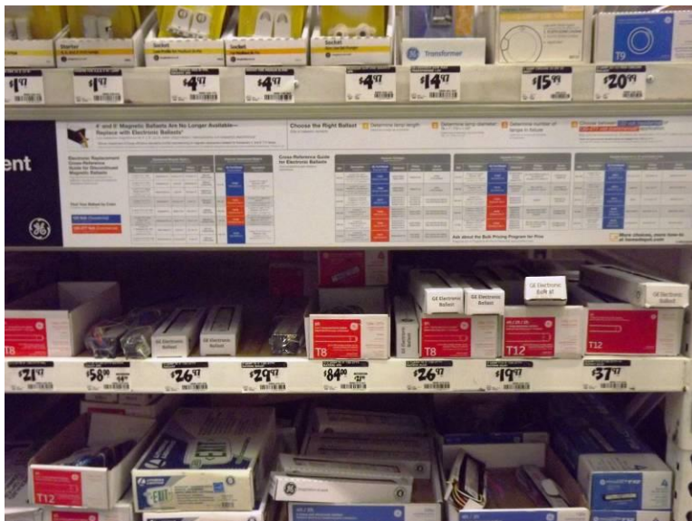
Figure 2 - Close-up of store display signage with instructions on how to select a ballast.