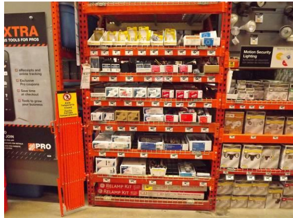
Figure 10 - Main display.

above eye level. Although it contained instructions on how to select a ballast, it did not specifically address the FCC rules nor prohibit the use of non-consumer ballasts in a residential environment. Figure 12 shows commercial ballasts included and mixed into store's display.