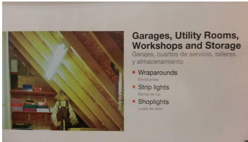
Figure 6 – Display signage for light fixtures shown in previous Figure 5.

This sign, and others showing home scenes, is directly above the three commercial fixtures, as shown next in Figure 7.