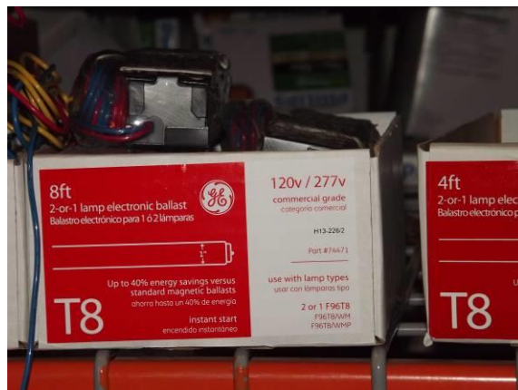
Figure 12 - Commercial ballast on sale and marketed to consumers. There is no FCC warning to indicate that this product cannot be used for residential applications.