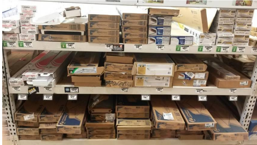
Figure 4 - The middle display containing both residential and commercial fluorescent light fixtures mixed together in no certain order.

The bottom left, third stack of fixtures in Figure 4 is the 4x48” T8 fixture pulled forward, and the three pulled forward on the lower right of the bottom shelf are all 4x48” T8 fixtures marked “For commercial use.” They are shown in greater detail below in Figure 5.