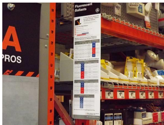
Figure 11 - Fluorescent ballast sign.