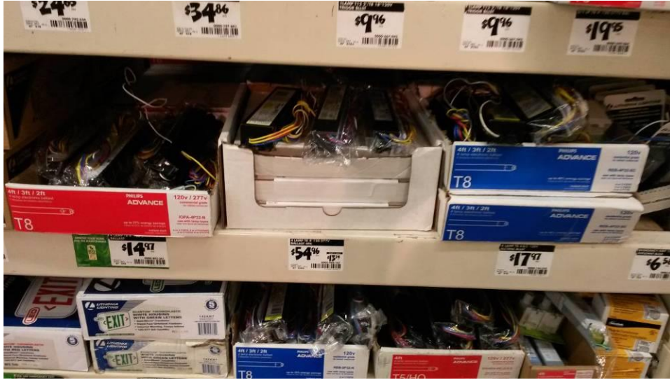
Figure 8 - Ballasts on display at Home Depot store in San Jose.