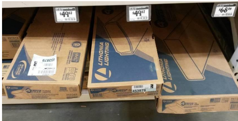
Figure 5 - Close-up of commercial fixtures in the residential section.

The bottom left, third stack of fixtures in Figure 4 is the 4x48” T8 fixture pulled forward, and the three pulled forward on the lower right of the bottom shelf are all 4x48” T8 fixtures marked “For commercial use.” They are shown in greater detail below in Figure 5.