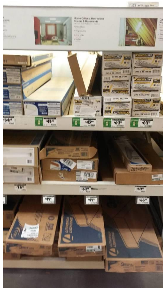
Figure 7 - Home scenes in vicinity of commercial lighting devices.

This sign, and others showing home scenes, is directly above the three commercial fixtures, as shown next in Figure 7.