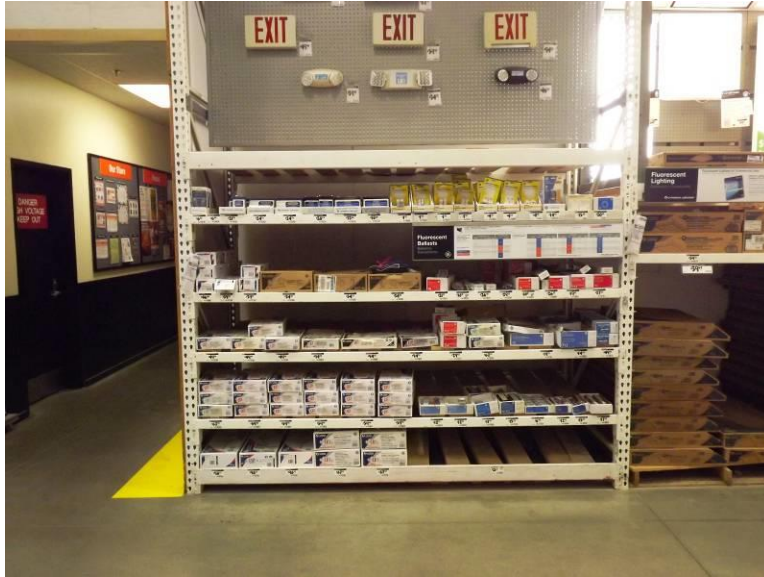
Figure 1 - Store display.