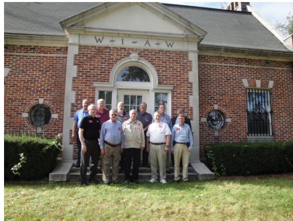
Figure 1 AZ, IL, WV, GA, AR, WTX, KY, WMA, ENY SMs + WV1X

So I have that nice magazine, what else do I receive for my annual dues? Are you a DXer? If so