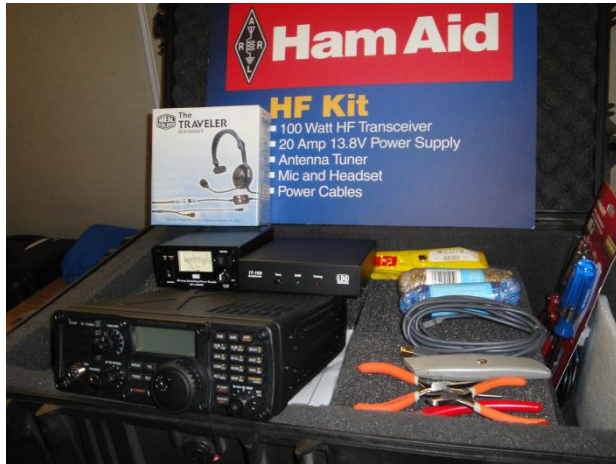
Figure 2 HF Go Kit sent to Puerto Rico

Have a problem with a neighbor with interference or need some advise on an antenna in your building? What better place to receive an answer by calling the Technical Information Service. Research information from the great annual ARRL Handbook and numerous other publications.