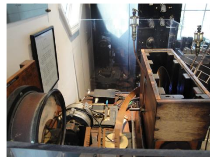
Figure 3 Original Hiram Percy Maxim, W1AW operational spark gap xmtr.

spearheaded a great response to Puerto Rico in their need for assistance during the aftermath of