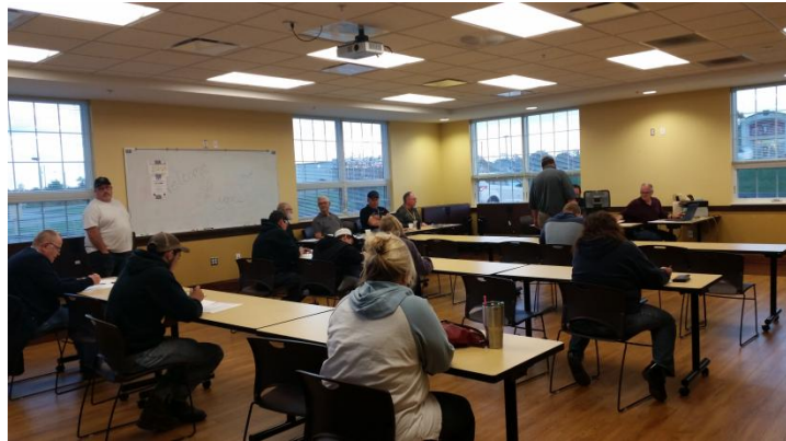
Figure 7 Local club testing

The primary purpose of our club is to provide emergency services with amateur radio communication in times of disaster or emergency. Additionally, the club encourages the exchange of information and cooperation between members. The club seeks ways to promote radio knowledge and operating efficiency, and manages programs and activities to advance the interest of Amateur radio.