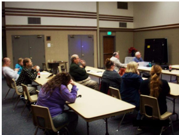
Figure 6 Members of their class Wittensville, KY