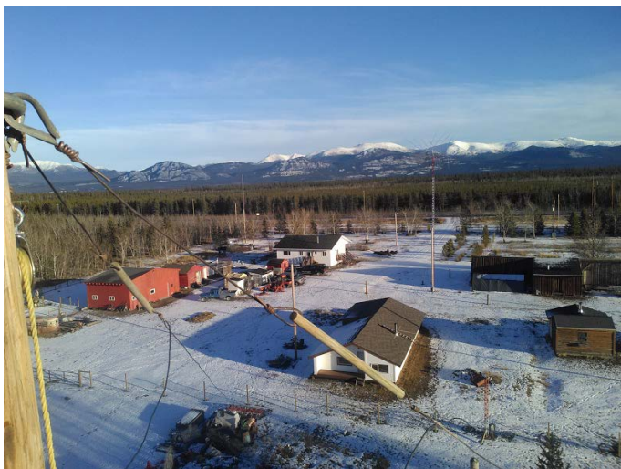
View from apex of VY1AAA Vee Beam

and, currently, the ends are only at 40 feet. However, the elements are 600 feet long.