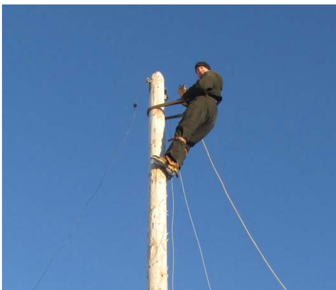
VY1SLZ Working on the Vee Beam

Low bands are amazingly quiet from the Yukon — Beverages optional. Because of the quiet, often you hear many people you cannot work.