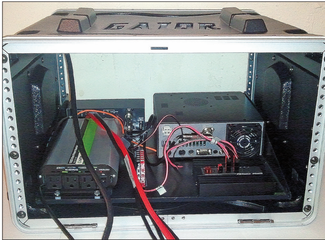
Figure 2 — Rear view of the bottom shelf installation.

cally handling the dc power supply and an external battery for times when ac power is not available. I also added a 1000 W dc to ac power inverter, and mounted a Powerwerx PS-6AA six-way Anderson Powerpole® splitter for 12 V power distribution, as seen in Figure 2.