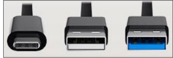
USB type-C USB 2.0 USB 3.0

macOS 10.7 or newer operating system At least one available USB 2.0 or 3.0 port*